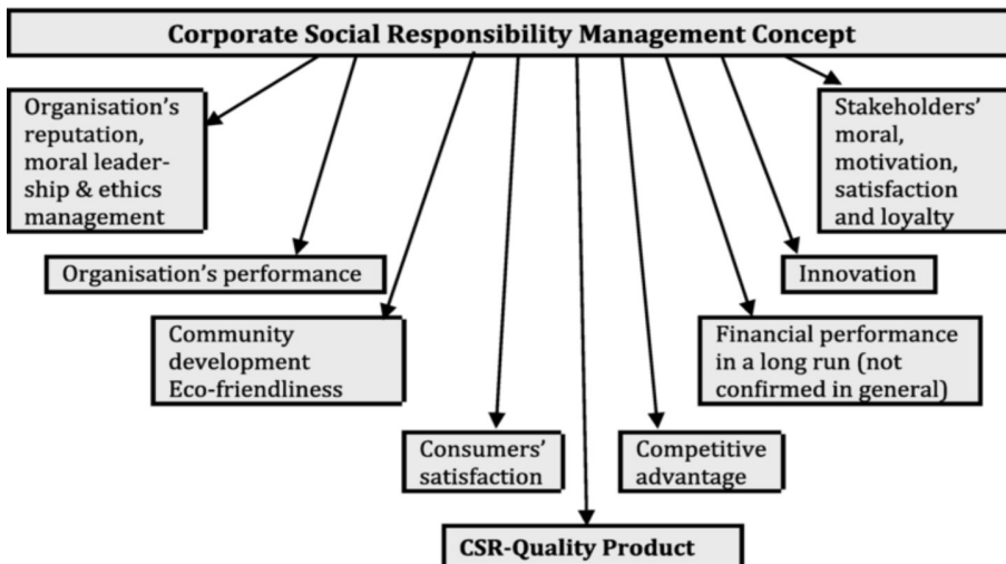
Figure 2: CSR management concept and its effects

Some of the nautical marinas on the road to success have come to the realisation that management must act in the direction of socially responsible business.