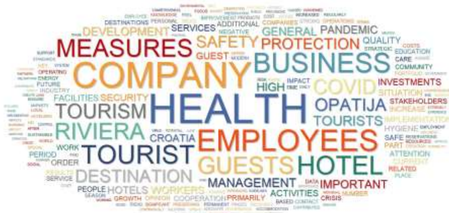
Figure 1. Graphical representation of the results: QDA Miner