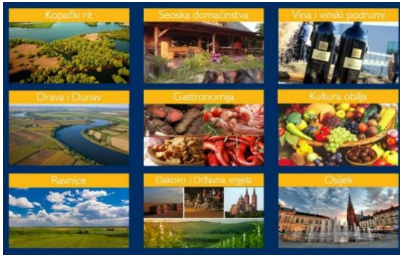
Picture 2. Tourist resources of Osijek-Baranja County

Source: Osječko-baranjska županija (2017.): „Master plana turizma Osječko-baranjske županije“, Osijek: Osječko-baranjska županija, str. 15.