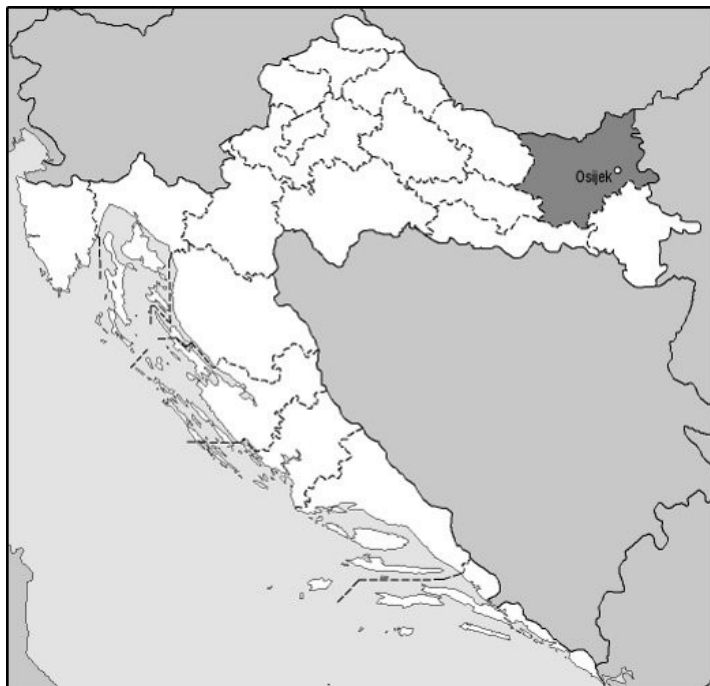
Picture 1. The Position of Osijek-Baranja County

Source: Hrvatska enciklopedija (2024): Osječko – baranjska županija, https://www.enciklopedija.hr/clanak/osjecko-baranjska-zupanija (accessed 25.05.2024.)